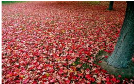
After Project Management